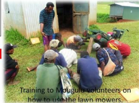
Training to Mougulu volunteers on how to use the lawn mowers.

Volunteers provide daily reports of the airstrip