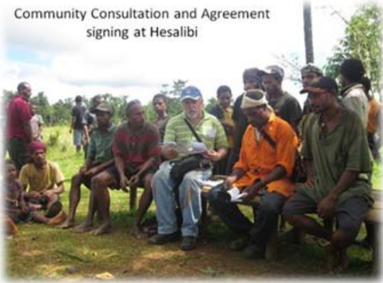
Community Consultation and Agreement signing at Hesalibi