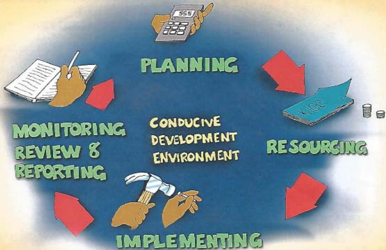
Diagram 3: The PIM Cycle